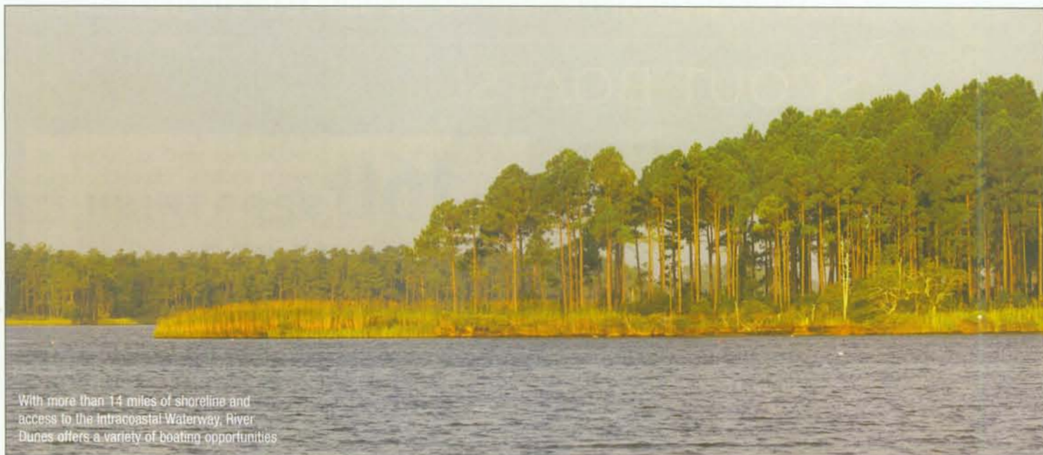
With more than 14 miles of shoreline and access to the Intracoastal Waterway, River Dunes offers a variety of boating opportunities.