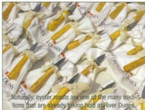
Naturally, oyster roasts are one of the many traditions that are already taking hold at River Dunes.

To find out more about what is offered in the community, call 800.975.9565 or visit www.riverdunes.com .