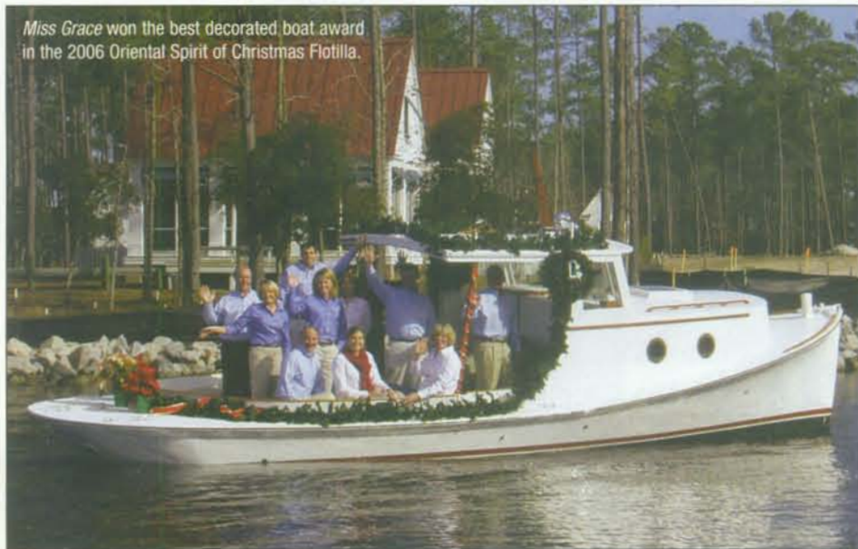
Miss Grace won the best decorated boat award in the 2006 Oriental Spirit of Christmas Flotilla.

ter, Mariners' Chapel, state-of-the-art fitness center, spa and wellness facility, and an open-air marketplace, all designed in River Dunes distinctive maritime village architectural style. New homes are now under construction in the Harbor Village. Every home is designed to maximize the wraparound water views offered on the marina and to provide opportunities for the ease and comfort of outdoor living and boating.