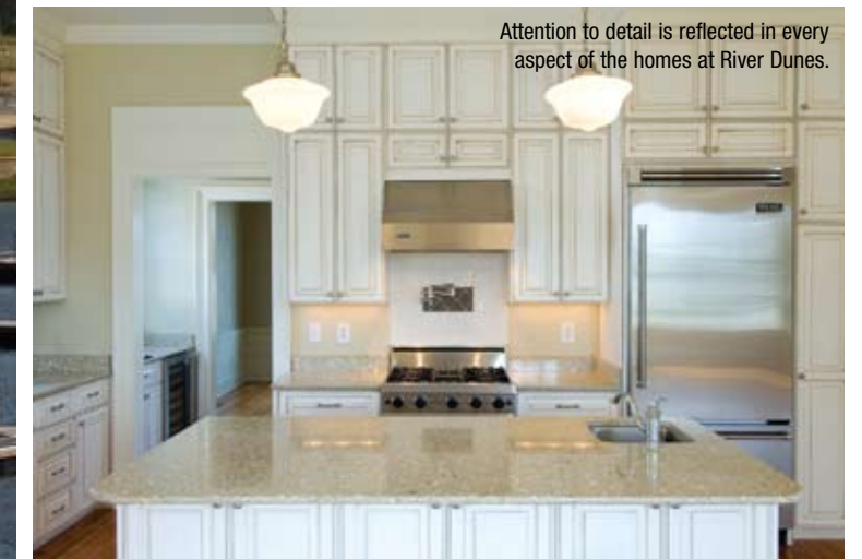
Attention to detail is reflected in every aspect of the homes at River Dunes.