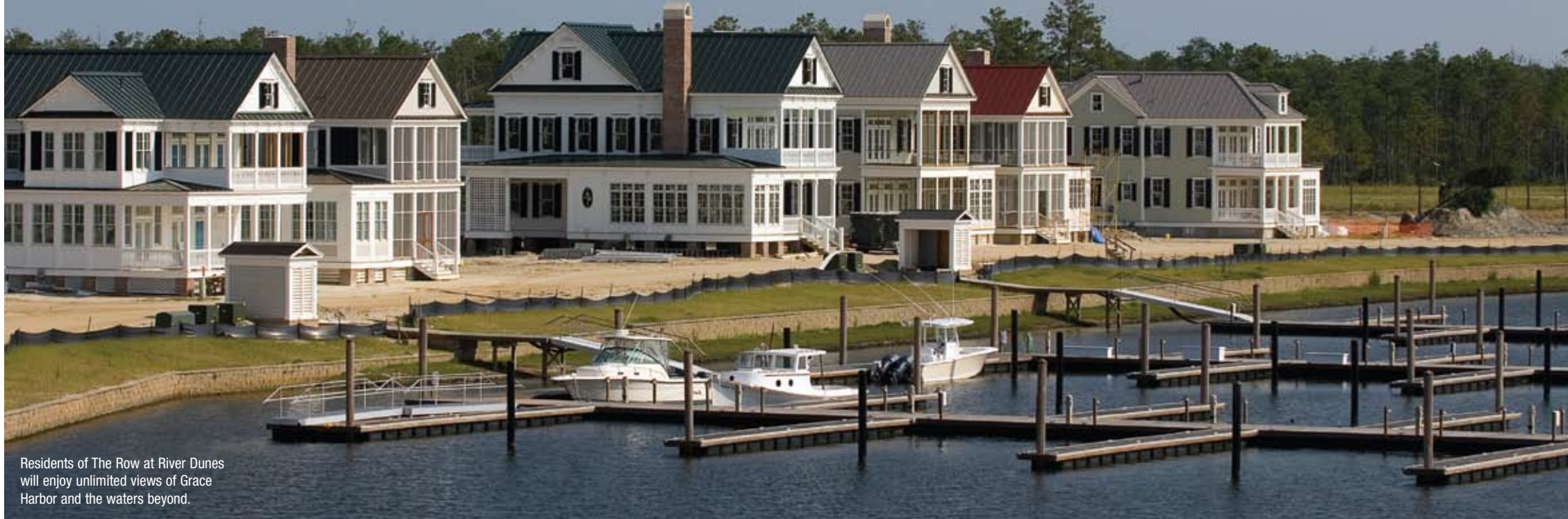
Residents of The Row at River Dunes will enjoy unlimited views of Grace Harbor and the waters beyond.