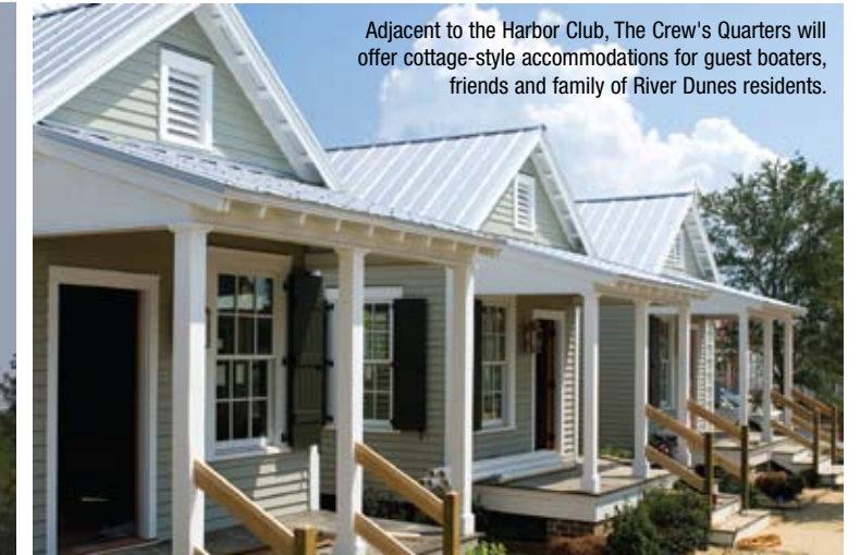
Adjacent to the Harbor Club, The Crew's Quarters will offer cottage-style accommodations for guest boaters, friends and family of River Dunes residents.